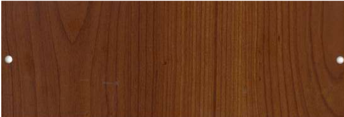
Figure 1: DS 733 + 1406/01

1406: planked wood effect, characterised by two types of flames (whole and cut flames, distanced 22 cm one from the other). The parts in between feature light and dark areas that resemble natural timber planks.