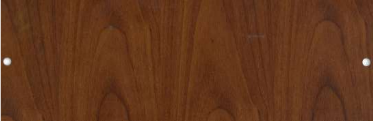
Figure 3: DS 733 + 1445/02

1445: this texture shows only one type of flame (whole flames distanced 8 cm one from the other). All the lines between the flames have been removed.