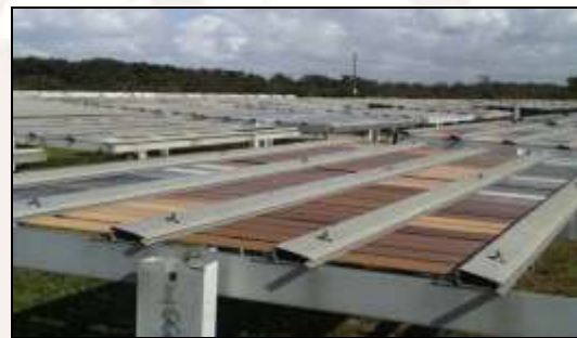
Natural Exposure Florida