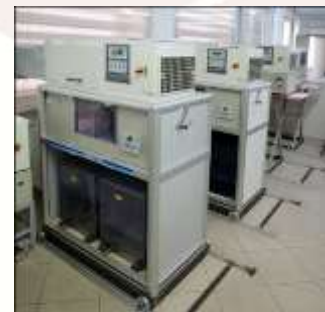
Accelerated Weathering Test devices Decoral Lab

Finishes are submitted to intensive light radiation and severe weathering conditions for long periods. The DecoralLab Accelerated Weathering Test devices (QSun3000 and Solarbox) simulate long term exposure to typical weather conditions. QualityDecoral Gold guarantee also requires the Natural Exposure Test, to be carried out in Florida where environmental conditions are harsher, for a three-year term.