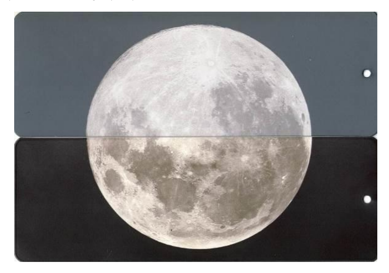
Figure 1: A picture of the moon, heat-transferred on one coat of DS 434 (upper panel) and two coats of PE411 + DS 407 (lower panel)

The two-coat system with a base coat of white polyester powder, known as "Cycle 11", is a process in which two powder coatings are applied to the same substrate to enhance the decorative effect (ex. marble, digital graphics, etc). Applying different powder coatings properly chosen (base coat: coloured powder; topcoat: clear powder), it is possible to bring out the decorative pattern to be transferred on the coated surface. When the sublimation inks penetrate the clear topcoat, their colour is brighter than it would be if they were heat-transferred into a coloured coating layer since powder pigments dim them. According to the topcoat, surface effect can vary from matt, textured, glossy, to special effects like Saltlake , Icetouch , etc.