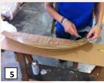
Cut film along the junction