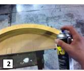
Glue the surface