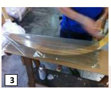
Place the film (attention: use film XXXX/YY L3 series)