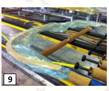
Vaccum using two heads (or one head, closing the other end)