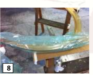
Bag the whole curved profile