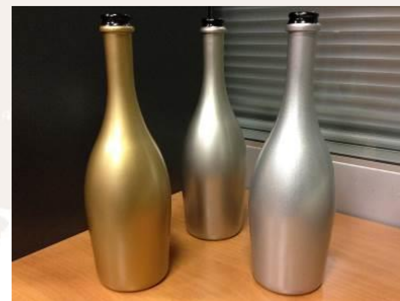
Left to right: glass bottles decorated with Goldlook-001, Titanlook-001 and Silverlook-001

The opportunity to recycle powder during the application without problems and without strictly controlled conditions represents an add value for these products.