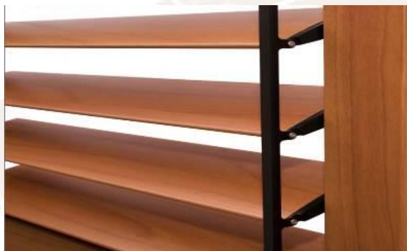
Sunscreens coated with textured powder-coatings and decorated with heat-transfer technology (wood effect)

A large variety of colours is available for this series, and they are valorised at their best when decorated with heat-transfer technology.