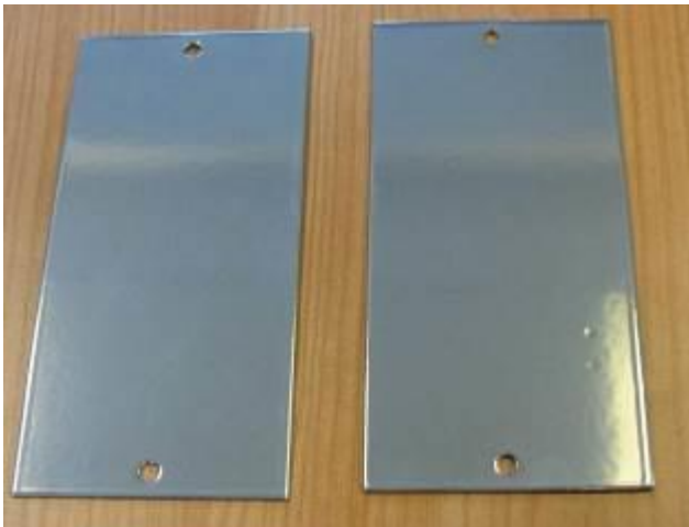
Exposed sample Reference Laboratory