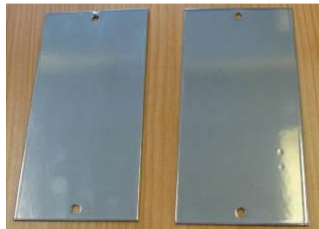
Exposed sample Reference Outdoor