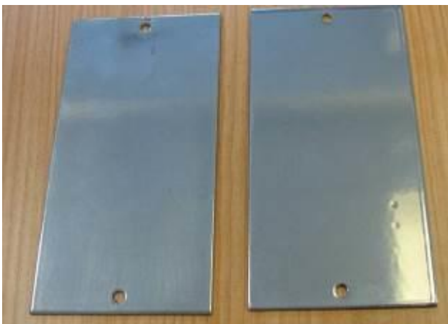
Exposed sample Reference Shaded outdoor