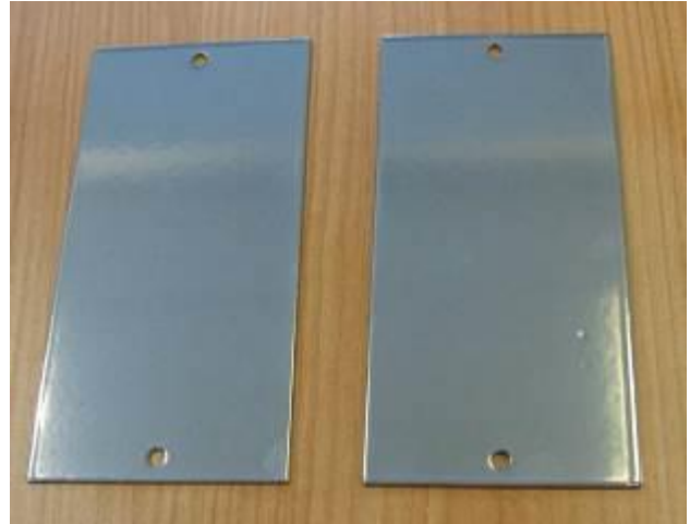
Exposed sample Reference Air-conditioned room (23°C-73°F)