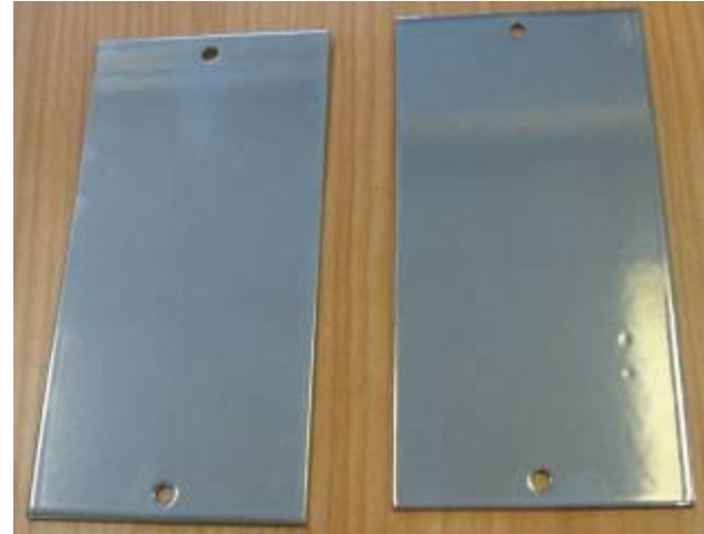
Exposed sample Reference Refrigerator (5°C – 41°F)