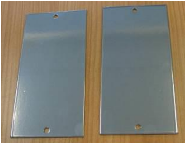
Exposed sample Reference Indoor