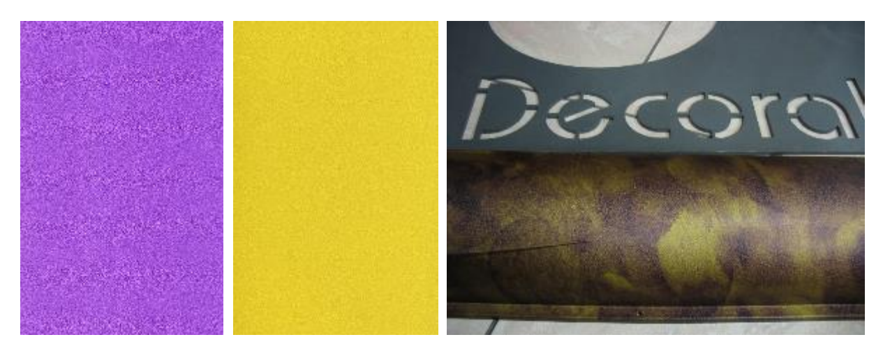
Picture 1: Icetouch-022 (left), Icetouch-007 (in the middle), Icetouch-023 decorated with heat-transfer film 75007/07M (right).

The main feature of the lcetouch powders is their unique rough surface: special additives afford both a peculiar roughness and a shine that differ definitely from typical textured powder coatings. All these products are suitable to decoration with heat-transfer technology.