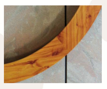
Decoration of an archshaped profile with L3 heat-transfer film

- Profiles are usually bagged in sublimatic films, then vacuumed and so kept in close contact with the surface to decorate.