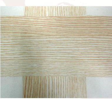
Two stripes of film with L3 carrier: the inks of the upper one (vertical) have been totally blocked by the lower one