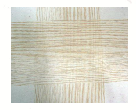
Two stripes of film with normal carrier (L) have been superimposed on one another and applied on a white coating: decorations are partially overlapped

- in the decoration of objects that require partial overlapping of the film, L3 carrier prevents inks from moving through both film layers, thus avoiding an overlap of the decor and at the same time allowing a simple and straightforward working of the object.