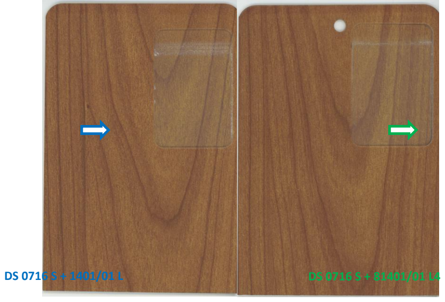
Pic 2: tested samplesfor 1000 hours (Standard powder) and 2500 hours (class 2 powder)