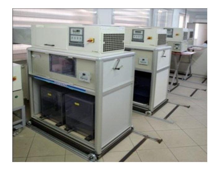
Pic 1: accelerated weathering test devices

To evaluate the resistance of the finishes, accelerated weathering tests are mainly used. These tests are carried out in lab, it means they are controlled and repeatable. They are meant to accurately simulate and recreate some of the natural exposure factors.