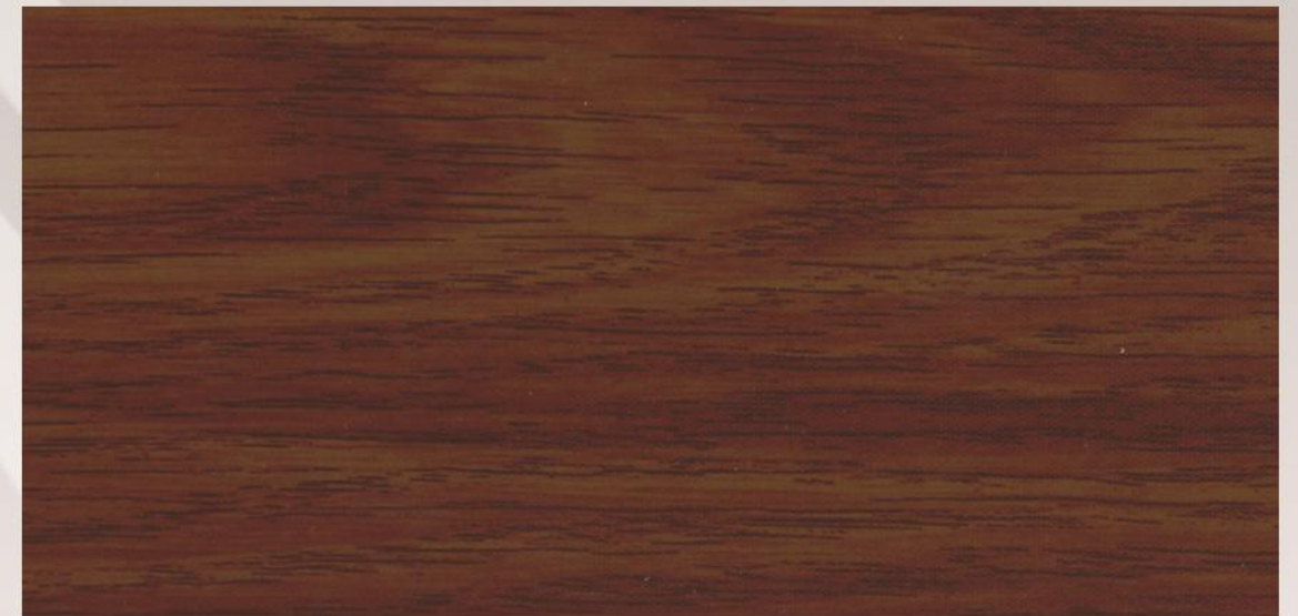
Powder Coating: DS DS-0821S + Heat Transfer Film: 2507/22