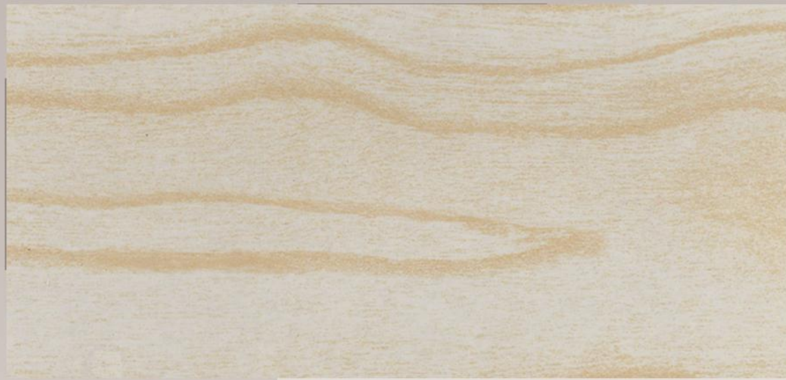
Powder Coating: DS-0834S + Heat Transfer Film: 2602/04