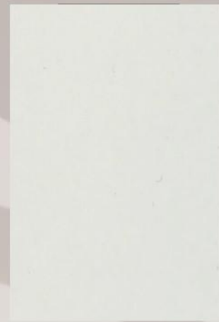
Powder Coating: DS-0834S