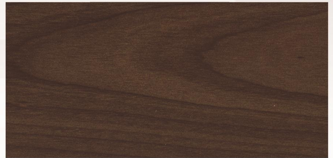
Powder Coating: DS-0875S+ Heat Transfer Film: 1401/11L