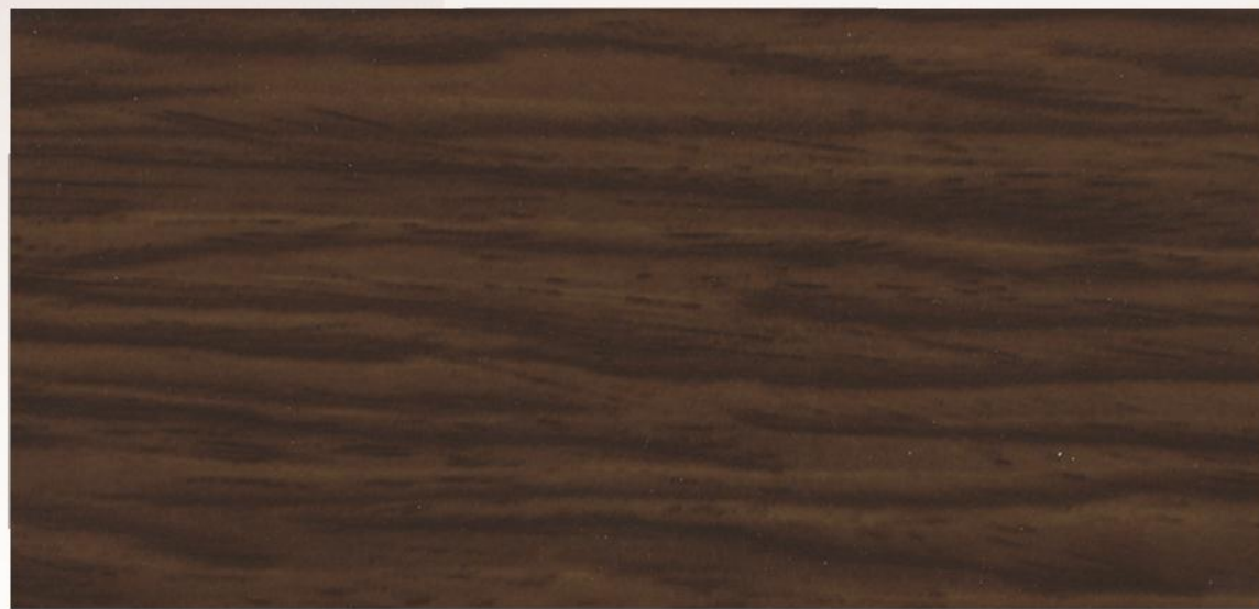
Powder Coating: DS-0875S + Heat Transfer Film: 2801/04