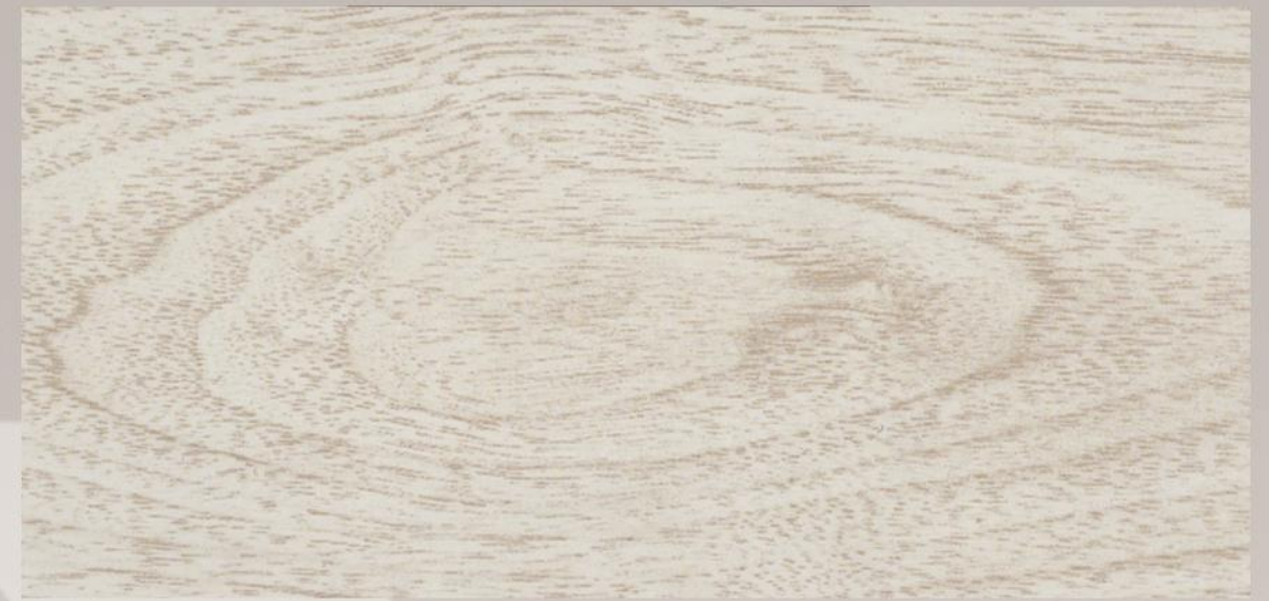
Powder Coating: DS-0834S + Heat Transfer Film: 2505/10