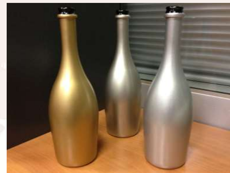
Left to right: glass bottles decorated with Goldlook-001, Titanlook-001 and Silverlook-001

The opportunity to recycle powder during the application without problems and without strictly controlled conditions represents an add value for these products.