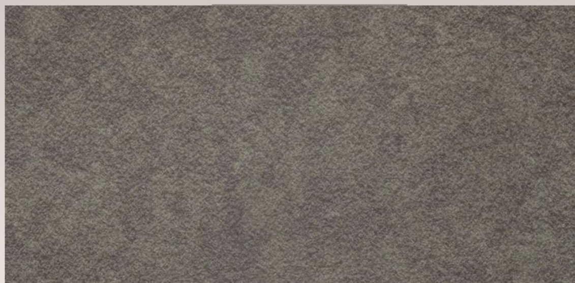
Powder Coating: IceTouch-013 + Heat Transfer Film: 6054/01