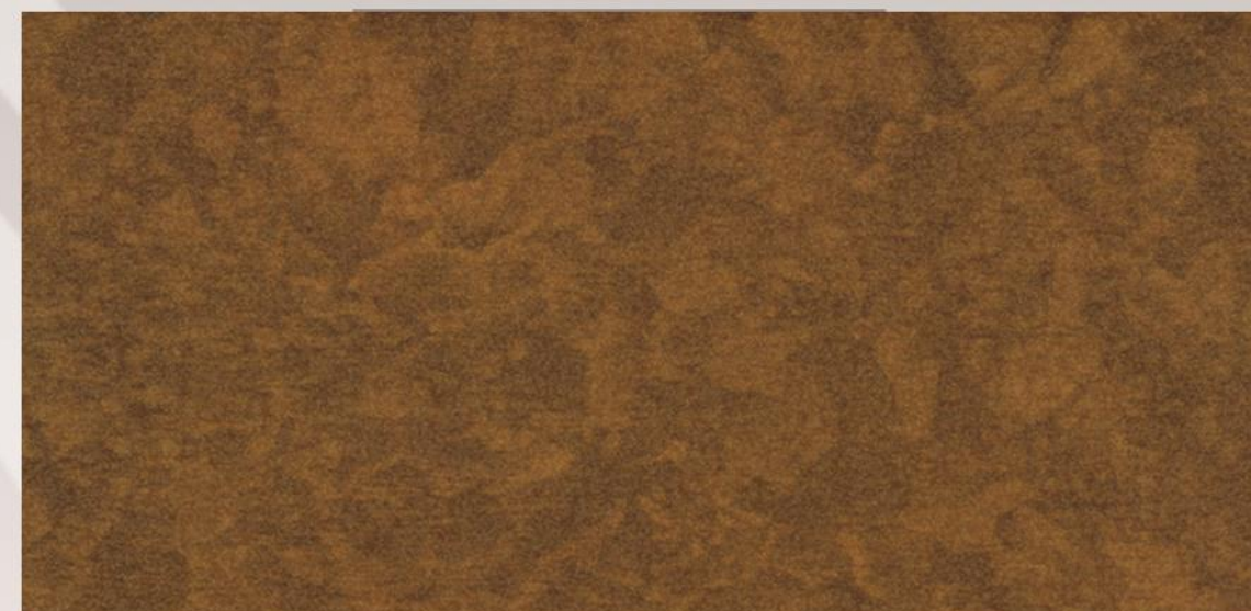
Powder Coating: Icetouch-011 + Heat Transfer Film: 6054/01