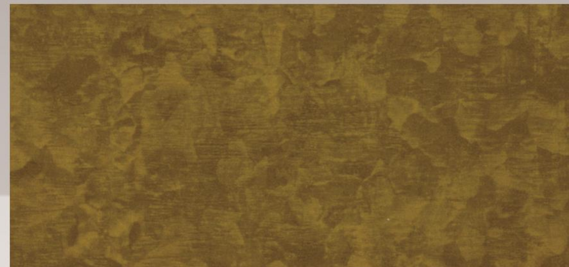
Powder Coating: 9C-048-A004 + Heat Transfer Film: 6054/01