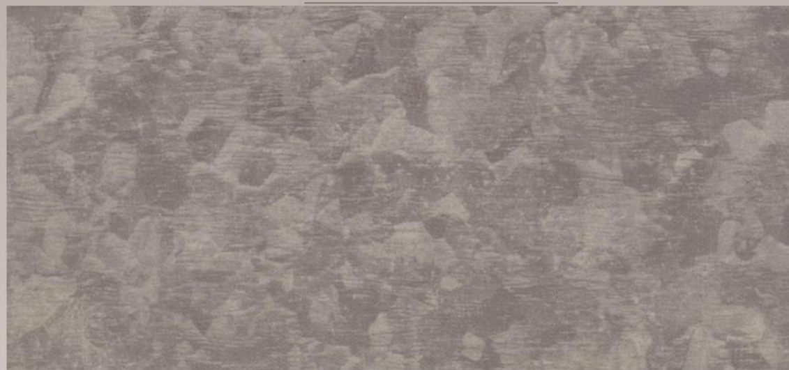
Powder Coating: MirrorL-183S + Heat Transfer Film: 6054/01